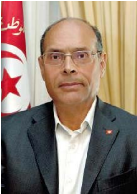
Dr. H.E Mohamed Moncef Marzouki

the CWAC’s Distinguished Speaker Series at noon, Thursday, March 23, at the Columbia Marriott (1200 Hampton). Marzouki was the first democratically elected president of Tunisia after the January 14th Revolution in 2011, a seminal moment in modern Arab history which heralded the onset of multiple popular revolutions throughout the Arab World.